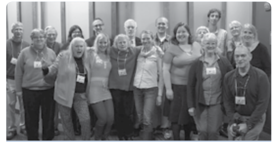
Cumberland County volunteers pose for a group photo before heading out to collect signatures for the Clean Elections Initiative.

MCCE is committed to reducing the influence of big money while elevating the importance of everyday voters in Maine's elections. We'll continue to monitor, analyze, and report on the money in this year's elections. See our reports at www.maineclipselections.org/mip